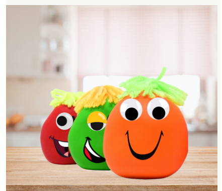
Let's make an Orli de-stress ball