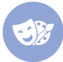
Culture and pastimes