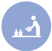
Food and farming