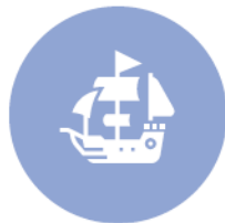
Travel and exploration