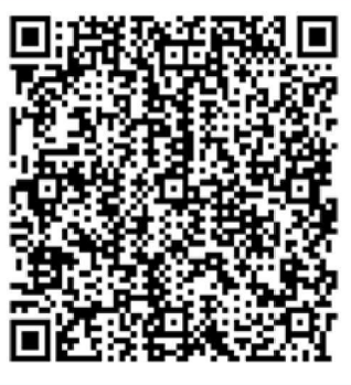
Scan the QR code to complete our service feedback questionnaire

Any worries or concerns I had were listened to and various different solutions were offered. The service has immensely helped myself and my child. The strategies given have helped not only my child but also myself with some difficulties that I was personally experiencing. It is also comforting to know that if I have any other issues or if anything arises in the future I am able to contact the service. The staff were a great help and I am so grateful for their support